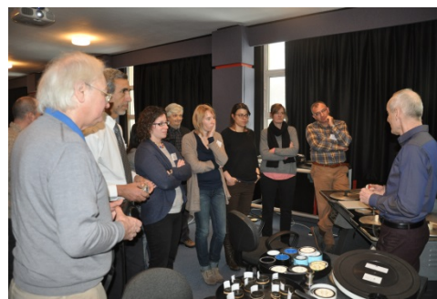
FIAF's Technical Training for Film Archivists in Istanbul, February 2015